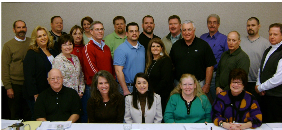
2009-2010 CBI Board of Directors