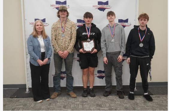
FCCC-Archbold Senior Division 2 nd Place