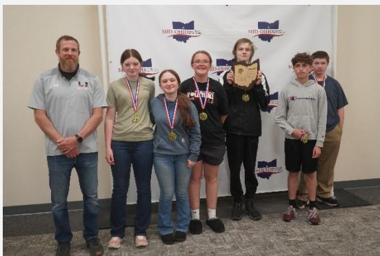
USV Team 2 Middle School Division 1 st Place