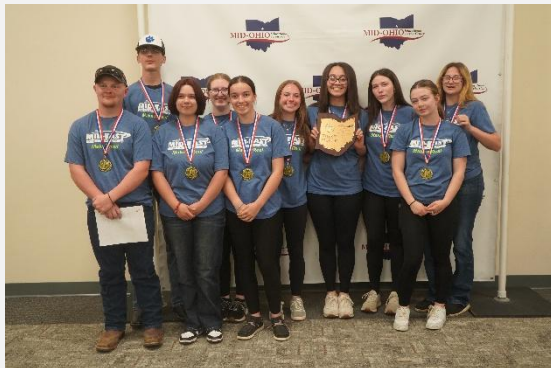
Senecaville-Murphy Junior Division 1 st Place