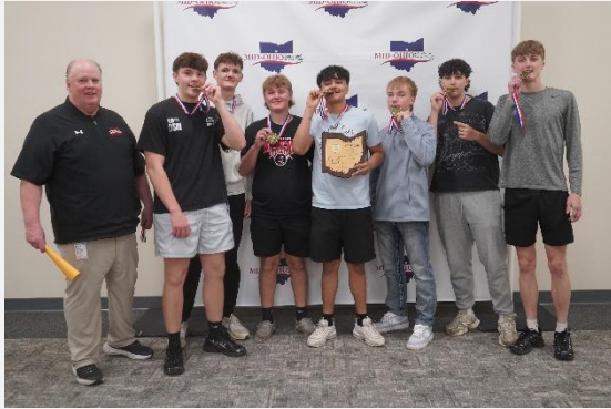
Kenton High School Senior Division 1 st Place